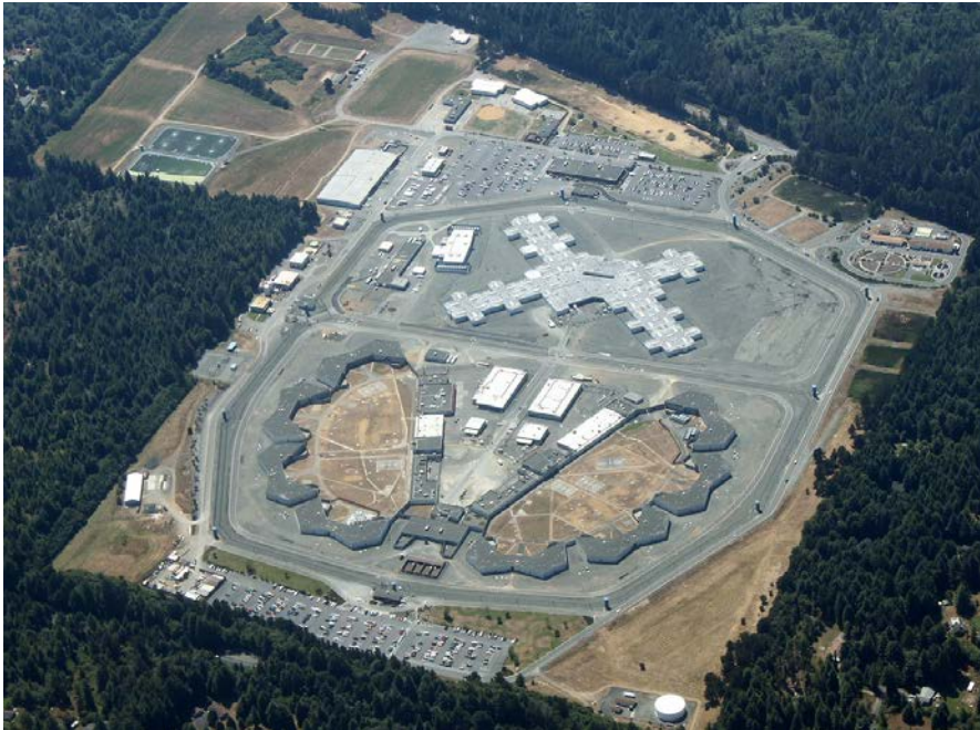
Aerial shot of Pelican Bay State Prison, a supermax facility.