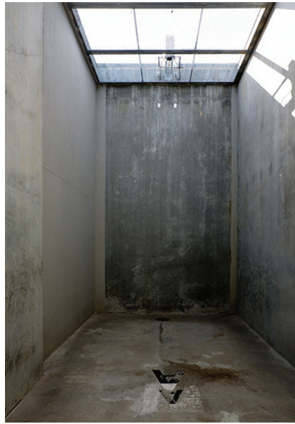
A “dog pen” at Pelican Bay State Prison: a small, enclosed cement “yard” where prisoners can exercise.

We are all too aware of the effects of long-term isolation, the lack of decent food and sunlight, the absence of human contact, and the dehumanization that results from such treatment. As Reyes reminds us, “Our Constitution protects everyone living under it; fundamental rights must not be left at the prison door.” It is CCR’s hope that this case will extend these basic human rights to the prisoners at Pelican Bay, strike a blow to the increasing use of solitary confinement in our nation’s prisons, and bring national attention to the international consensus that prolonged solitary confinement is a form of torture.