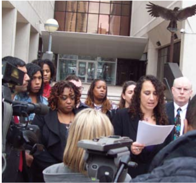
February 16 press conference at the filing of Doe v. Jindal in New Orleans, Louisiana

Our clients are not alone in being forced to register as sex offenders solely as a result of a Crime Against Nature by Solicitation conviction. Indeed, almost 40 percent of registered sex offenders in Orleans Parish are on the