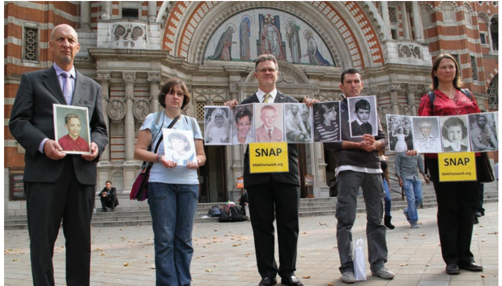
Survivors and allies spread the word about the ICC filing during European tour.