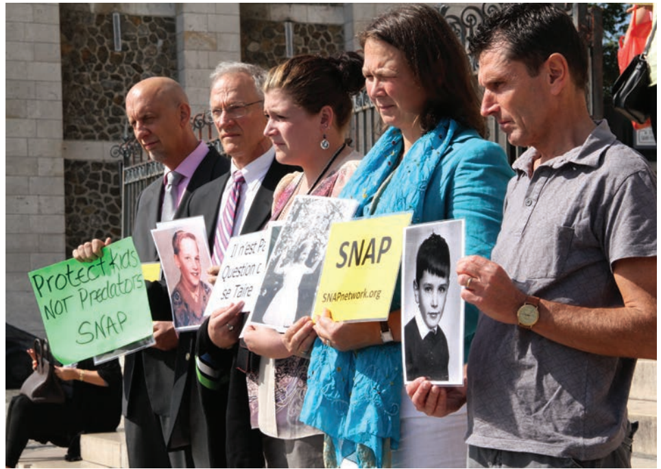
Survivors hold up photos of themselves at age of abuse.

On September 13, 2011, CCR, in partnership with the 10,000-strong Survivors Network of those Abused by Priests (SNAP) filed a landmark complaint before the International Criminal Court (ICC) at The Hague urging the Court to investigate and prosecute the Pope and other high level Vatican officials for enabling and facilitating the systematic and