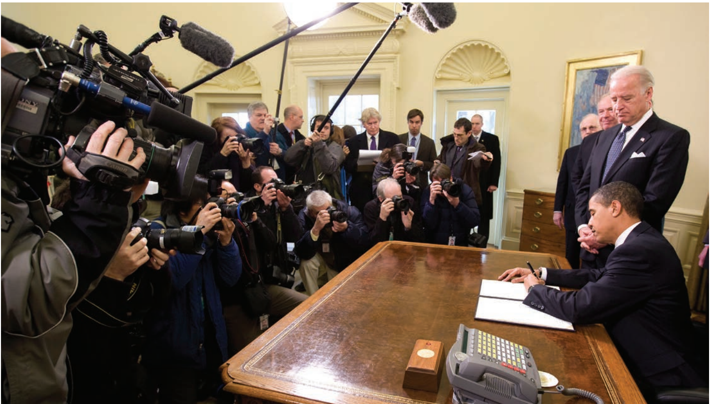
January 22, 2009. President Barack Obama signing an executive order promising to close the prison at Guantánamo “no later than 1 year from the date of this order.”